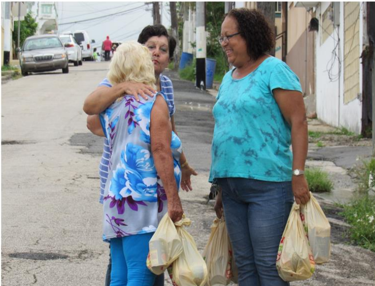
Methodist Church Food Distribution