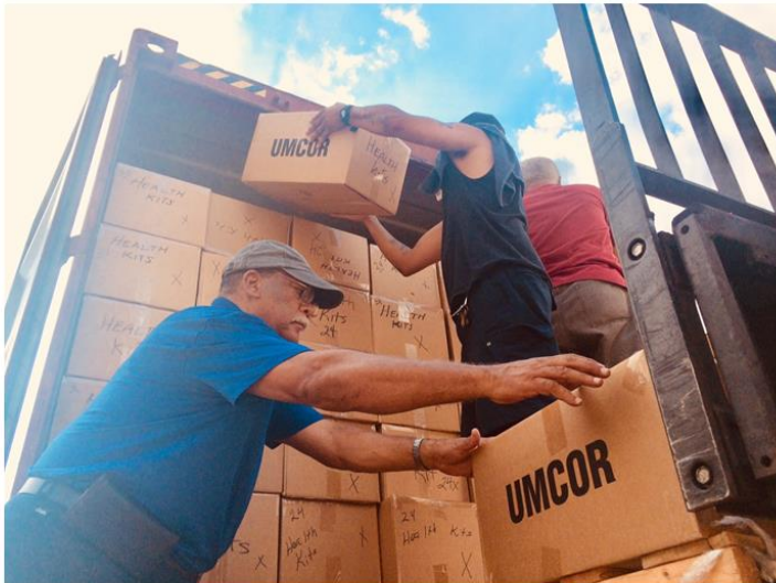
UMCOR Relief Containers - Loading