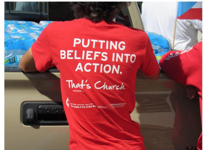
Methodist Church Food Distribution