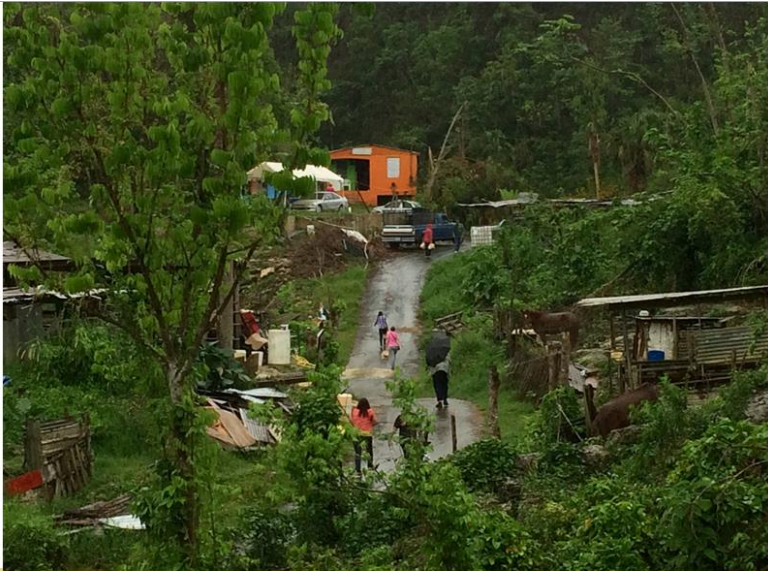
Methodist Church Food Distribution