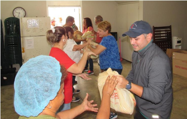
Methodist Church Food Distribution