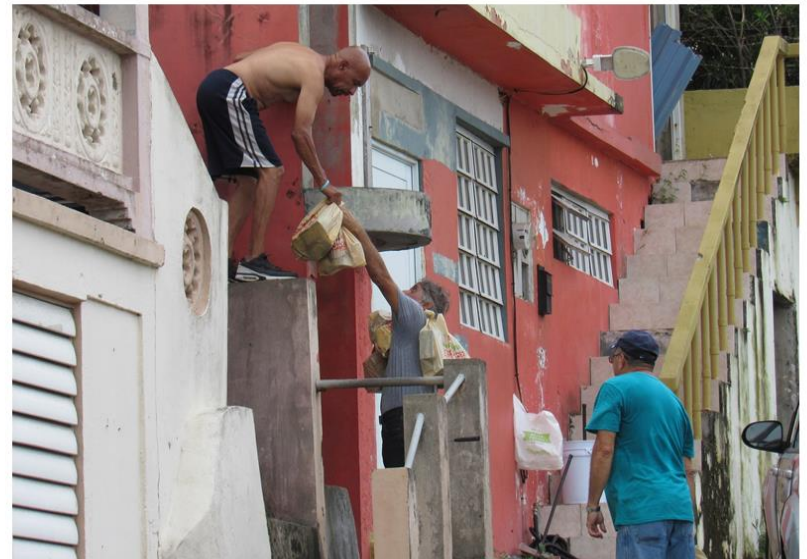
Methodist Church Food Distribution