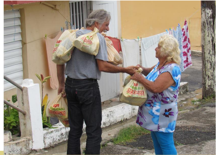
Methodist Church Food Distribution