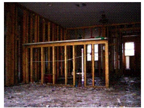
Moldy walls removed, MS

Since October I have continued to assist with the Hurricane relief efforts by serving as Interim Executive Director at our UMCOR Sager Brown Depot in Baldwin, LA. From this 44,000 square foot facility, United Methodist relief efforts have and continues to provide significant assistance to hurricane relief from Western Alabama to Eastern Texas. And, while serving the hurricane relief efforts, UMCOR has sent thousands of school bags and health kits, clothing, blankets, and other relief items to overseas countries such as Sudan, Afghanistan, and Haiti.