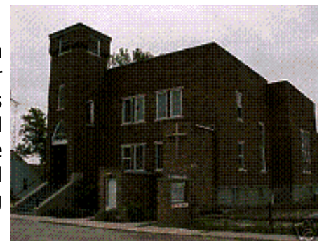
United Methodist Church, RedKey, IN