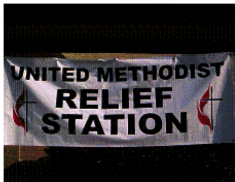
Gulfport Relief Center, MS