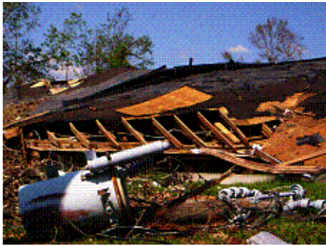
Crushed homes, no power, MS