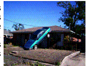
9 th Ward, New Orleans, LA

Since October I have continued to assist with the Hurricane relief efforts by serving as Interim Executive Director at our UMCOR Sager Brown Depot in Baldwin, LA. From this 44,000 square foot facility, United Methodist relief efforts have and continues to provide significant assistance to hurricane relief from Western Alabama to Eastern Texas. And, while serving the hurricane relief efforts, UMCOR has sent thousands of school bags and health kits, clothing, blankets, and other relief items to overseas countries such as Sudan, Afghanistan, and Haiti.